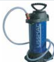
[ 3 ] Water pressure tank