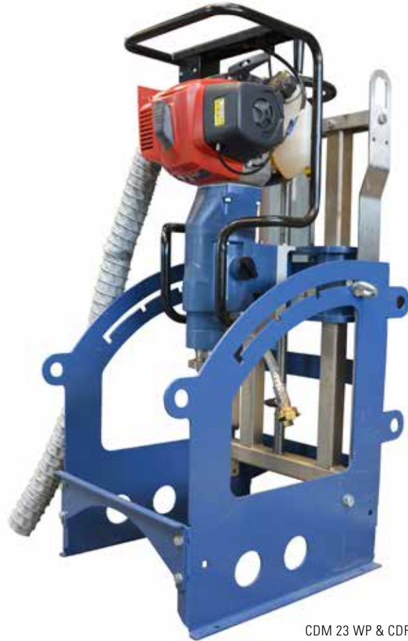
CDM 23 WP & CDR 350