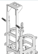
[ 2 ] Digger shovel frame